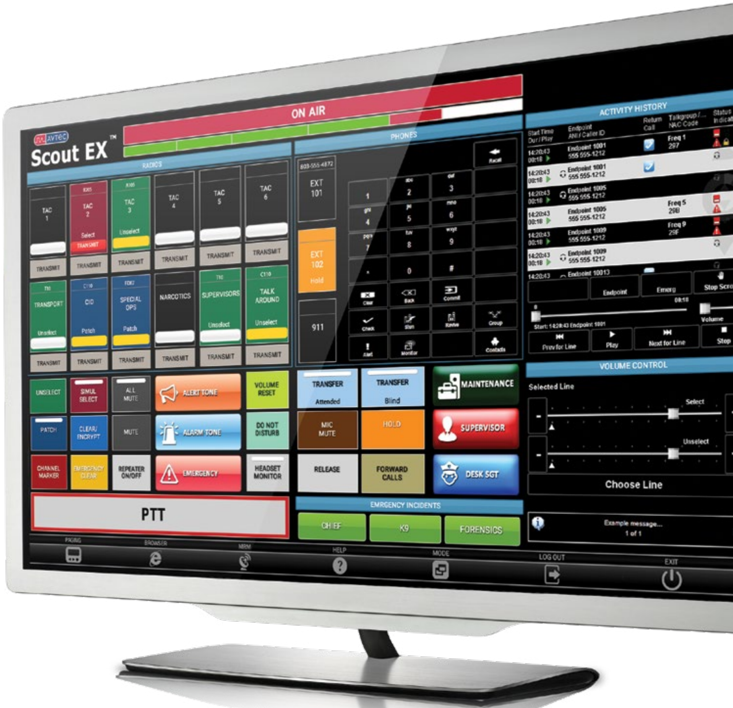
Avtec Scout EX Dispatch Console